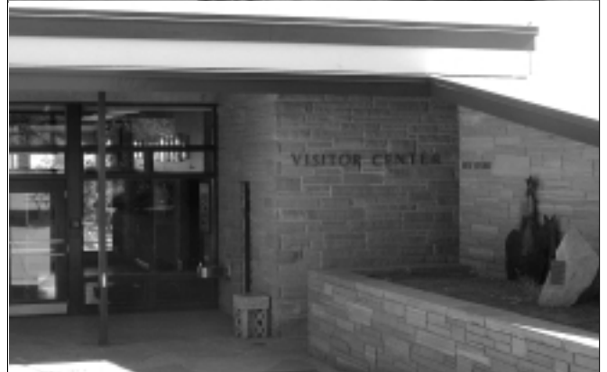
The low, horizontal profiles of the CNM Visitor Center complement the red rock landscape of the park.