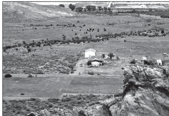
The same site as it appears today. The house is remodeled from one of the original buildings.

there would be a labor shortage. The Peach Board of Control and the Mesa County Cannery Association decided to utilize the German POWs incarcerated at Camp Carson, south of Colorado Springs. The military-style CCC camps in Mesa County proved to be perfect for housing these POWs. One was established at the old CCC camp in Palisade, where the water treatment plant now is, and the other at NM3C, known as the "Fruita" camp.