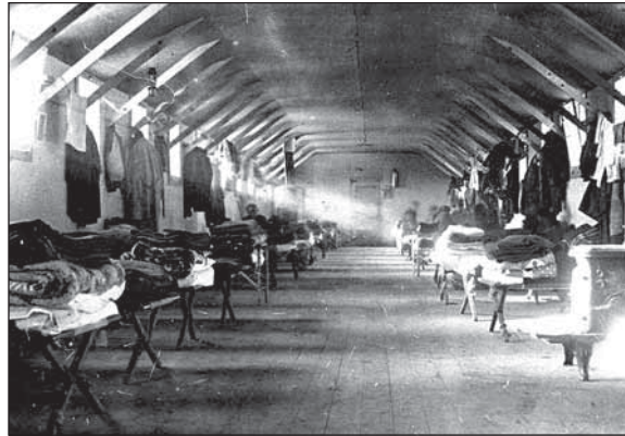
The interior of one of the barracks at NM3C as it appeared just prior to WWII.